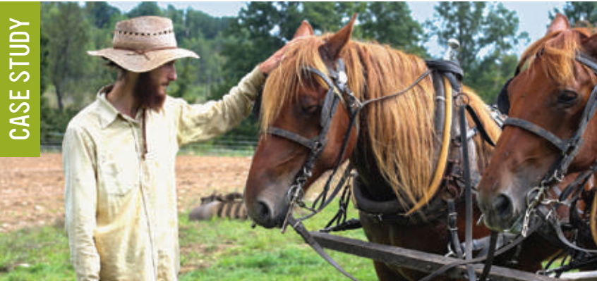
Great Song Farm