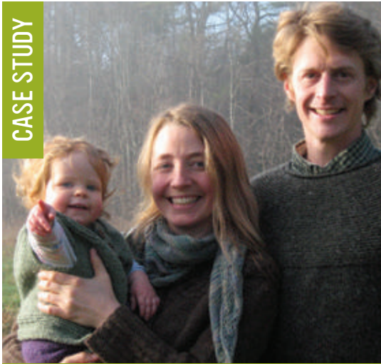
Maine Farmland Trust